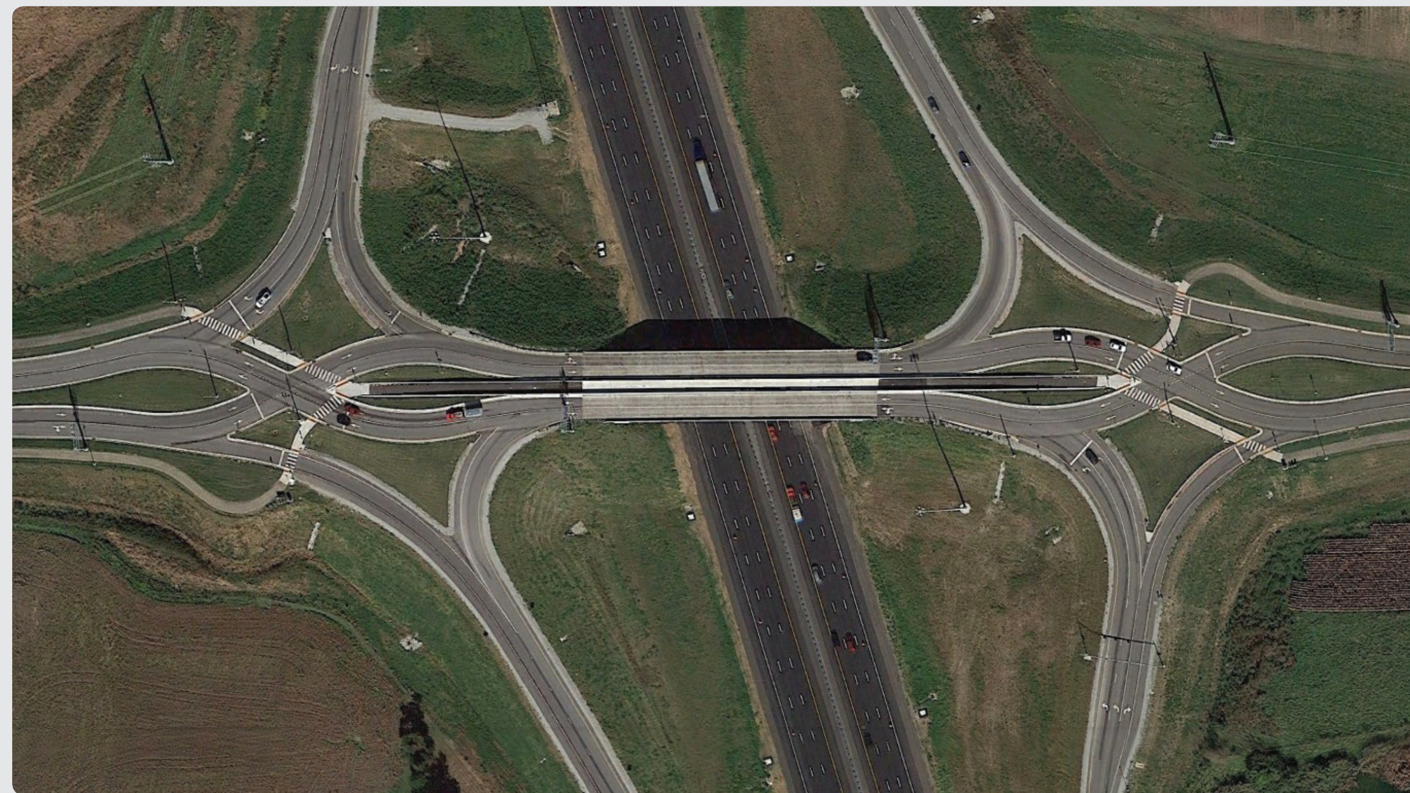
Diverging Diamond Interchange