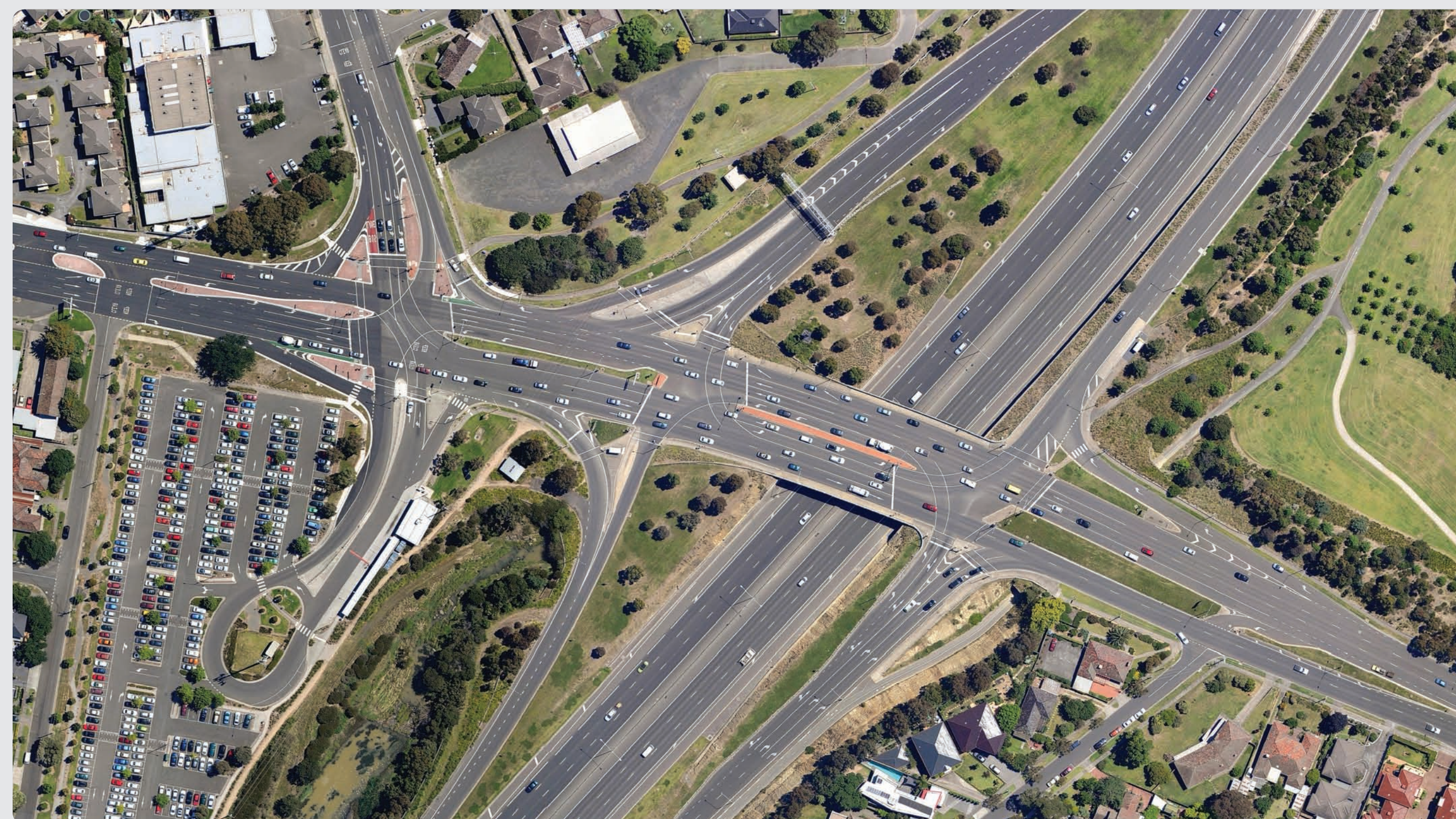
Traditional Signalized Diamond Interchange