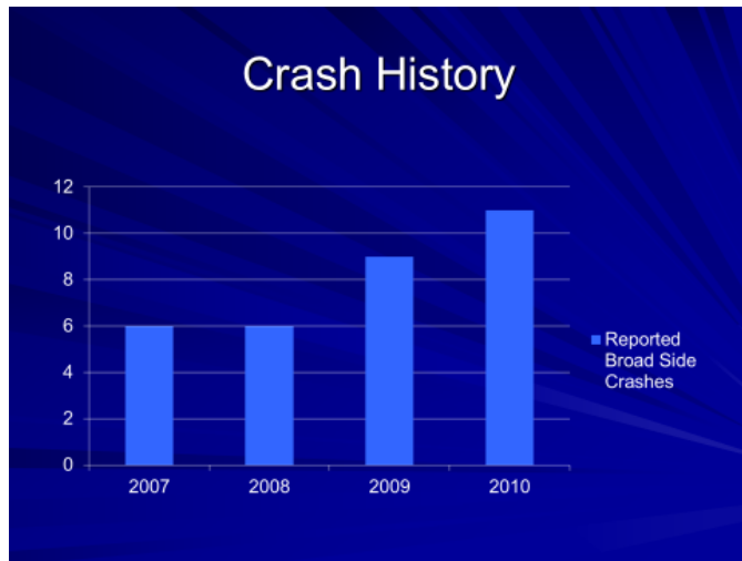
Crash History from 2007 and 2010 at Intersection

The current traffic control at the intersection is a two way stop sign on Lamar Street and no stop signs on West 14 th Avenue. There is an emergency signal on the west leg for the fire station on the NW corner of the intersection. The crash data was also reviewed and revealed a substantial number of crashes between 2007 and 2010, ranging from 6 broadside crashes per year to 11 per year respectively. This data did warrant a signal at this location, although a roundabout configuration was also a consideration (4).