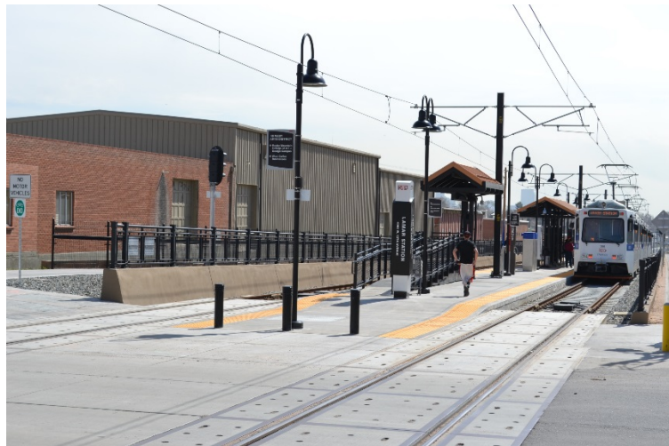
Lamar Street Light Rail Station

The Regional Transportation District completed their West Rail light rail line connecting Denver to Lakewood and Golden in Colorado on April 26, 2013, which provides a critical multimodal link to the Denver metropolitan area transportation network. One of the light rail stations is located at Lamar Street and West