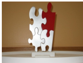
Art Work in Center of Roundabout

To provide further enhancements for this important intersection within the art district, the city worked with a neighborhood brick manufacturer to procure their bricks as aesthetic elements for the roundabout