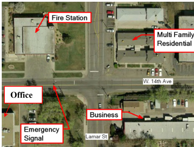
Existing conditions at the Intersection

The intersection at West 14th Avenue and Lamar Street is located south of West Colfax Avenue; north of West 13th Avenue and the new light rail line; east of Wadsworth Boulevard, a major north-south arterial; and west of Sheridan Boulevard, a major north-south arterial; in Lakewood Colorado. West 14th Avenue is a two-lane east-west collector street and Lamar Street is a two-lane north-south collector street. Lamar Street is stop-controlled whereas West 14 th Avenue is not. There are sidewalks along Lamar Street, north of West 14th Avenue, and intermittent sidewalks to the south of West 14 th Avenue. Although sidewalks are present they are inconsistent along West 14 th Avenue. There are paved shoulders on each side of west 14 th Avenue.