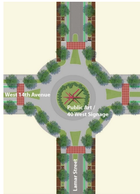
40 West Arts District Concept

A straightforward three-phase method of maintaining traffic during construction was developed by the city. The plan involves shifting traffic to the east at the intersection initially using the existing roadway pavement and constructing the roundabout improvements on the west side of the intersection. The second phase shifts traffic to the west on the new asphalt pavement and building the east side of the intersection. The final phase requires closing the intersection to all but local traffic to build the central island and splitter islands. Fire trucks and local traffic will only be allowed to travel eastbound on West 14 th Avenue and southbound on Lamar Street (south of West 14 th Avenue); the north leg will be totally closed to traffic during this phase. Detour routes and signs will be used to direct traffic during the final phase.