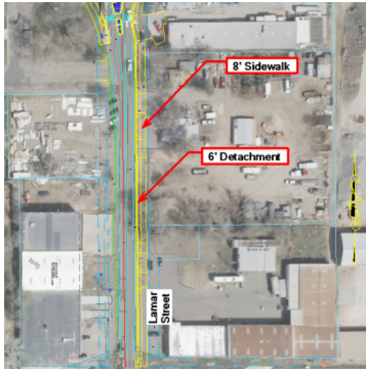
Pedestrian Connections between West 13 th and West 14 th Avenues

The 110-foot ICD roundabout was designed to include a 20-foot circular roadway width, a 12-foot truck apron, a 30-foot central island space for art and landscaping (5). A new emergency signal was designed for the fire station on the west leg of the intersection.