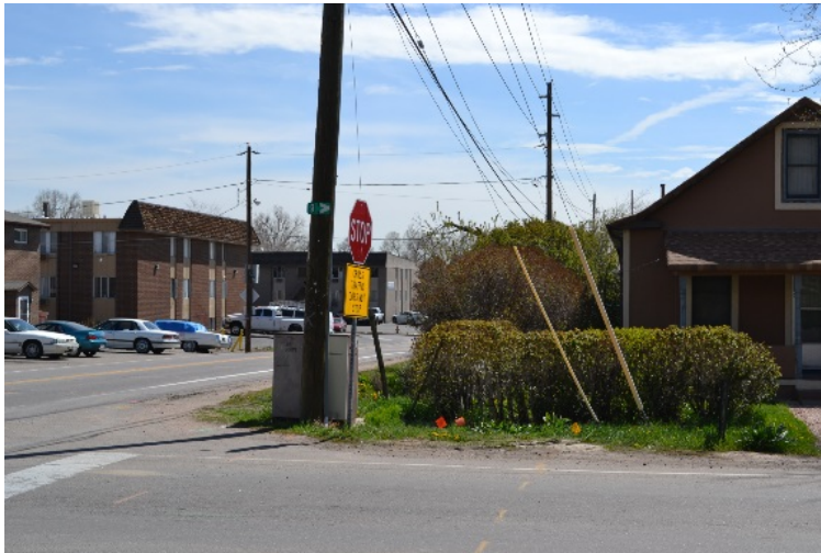
Poor Sight Distance at the Intersection

The momentum of the 40 West Arts district was strong and finding a way to blend safety and pedestrian connectivity improvements with the creative and aesthetic elements desired was important to the community. In addition, RMCAD was growing and expanding and was helping to foster the district with their energy and talent.